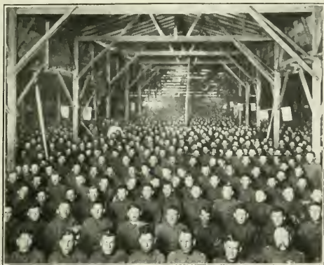
INTERIOR CAMP LOGAN, HOUSTON, TEXAS TABERNACLE

This picture was taken at the close of an illustrated lecture on "Personal Purity." 3,700 men crowded into the building. More than 12,000 soldiers heard lectures in one day and 40,000 in four days.